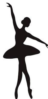
He's / She's a dancer.