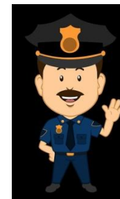
Hi! I'm / You're a police officer.